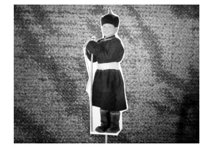
Paper puppet of a Mongolian boy

After that, students learn about foreign countries from which we Japanese import goods and materials and to which we export our products. There are many Asian countries in the top 10. They realize the importance of Asia in terms of economics, as well.