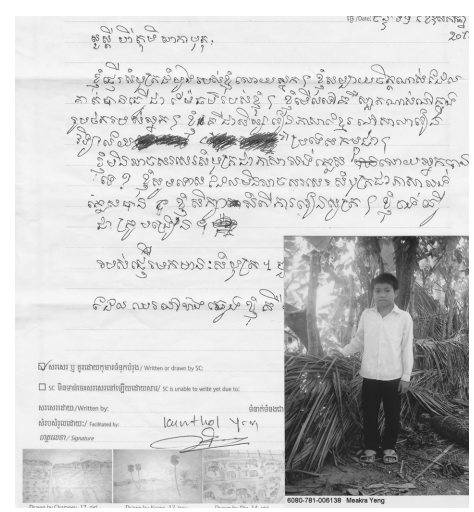
A letter from a Cambodian boy

When I observed an English class on various letters around the world (Lesson 2 in "Eigo Note 2"), the teacher taught about this topic very lightly and quickly, saying, "Oh, there are various types of